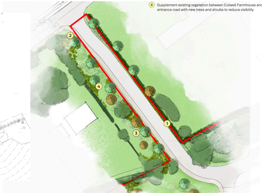
Site access (enlarged)

The proposed site access on Lewes Road (A272) lies between North Colwell Farmhouse and number 90 Lewes Road. Some existing vegetation and trees will need removal but will be replaced with tree planting and hedging to blend the landscape.